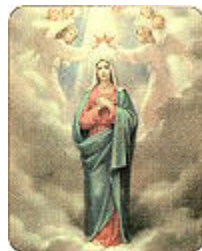
5. The Coronation of Mary