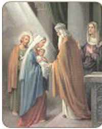
4. The Presentation of Jesus