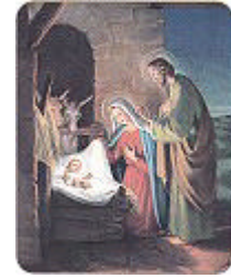
3. The Birth of Our Lord