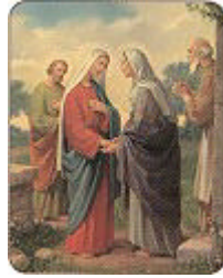
2. The Visitation