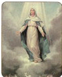
4. The Assumption of Mary