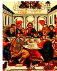
5. First Eucharist