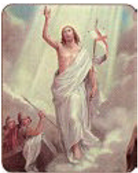
1. The Resurrection