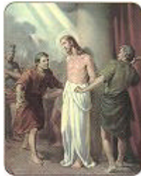
2. The Scourging at the Pillar