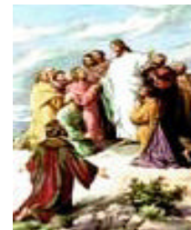
3. Proclamation of Kingdom