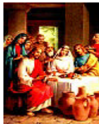
2. Cana Wedding