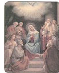
3. Descent of the Holy Spirit