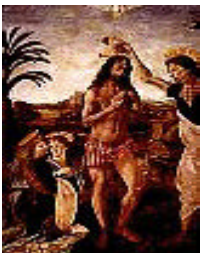
1. Baptism in the Jordan