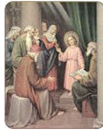
5. The Finding of Jesus