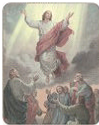
2. The Ascension