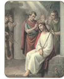
3. The Crowning with Thorns