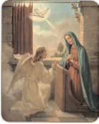
1. The Annunciation