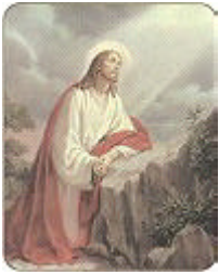
1. The Agony in the Garden