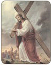
4. The Carrying of the Cross